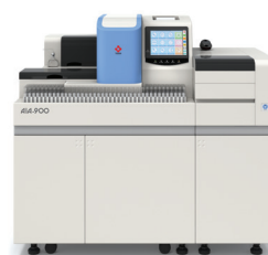
AIA-900 with 9 Tray Sorter (Also available in 19 tray sorter option)