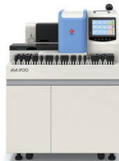
AIA-900 Loader Model